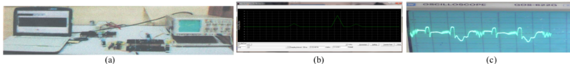
Fig.3: Wireless ECG development: (a) WECG Testbed configuration at indoor environment, (b) a typical heart pulse detected at Laptop or PC created using the designed Delphi program, (c) Heart pulses on oscilloscope for testing ECG circuit.